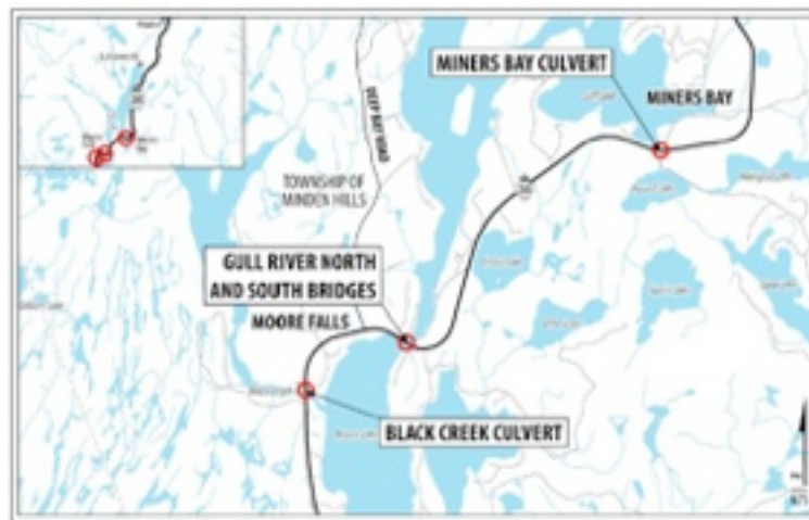
Study Area Key Map

At this point, there is no indication that the repair work will include any new solution to a portage that will replace the rollers that were removed between Gull and Moore Lake.