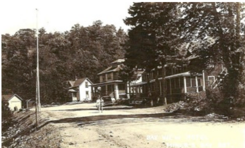
Miners' Bay Lodge c. 1938

After the second half of the main lodge was constructed.