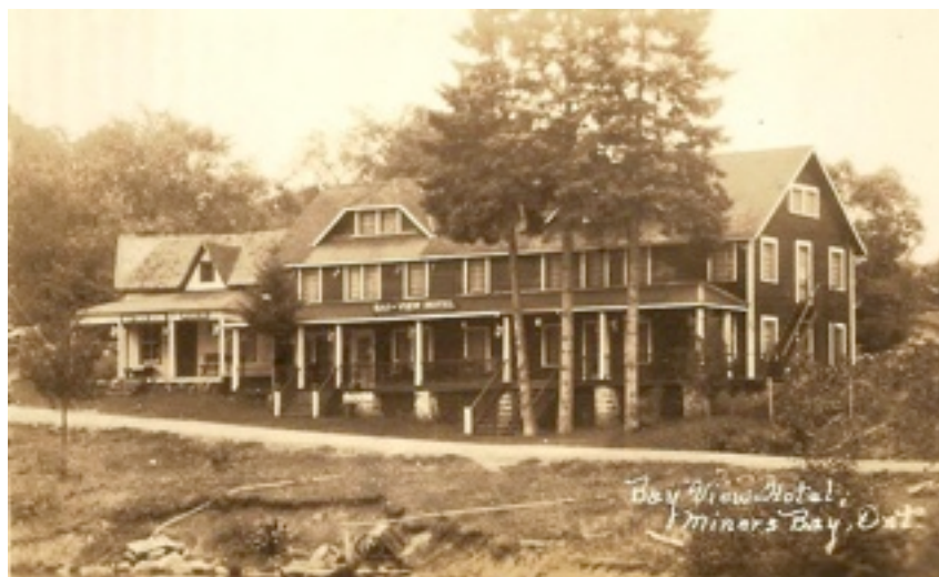
Bay View Hotel c. 1920

Showing the Galloway farmhouse and first half of the lodge as well as the wooden bridge, which is now part of Hwy 35.