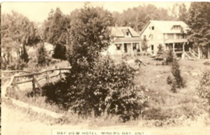
Bay View Hotel c. 1917

Showing the remains of the dam from the sawmill.