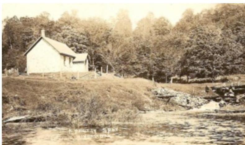
Miners' Bay Church c.1916

Showing the remains of the dam from the sawmill.